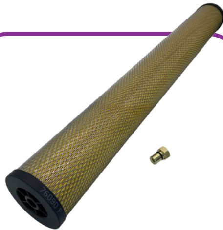
Omega Air Line Filter