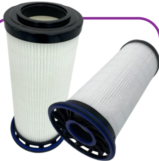
Ingersoll Rand Oil Filter Cartridge