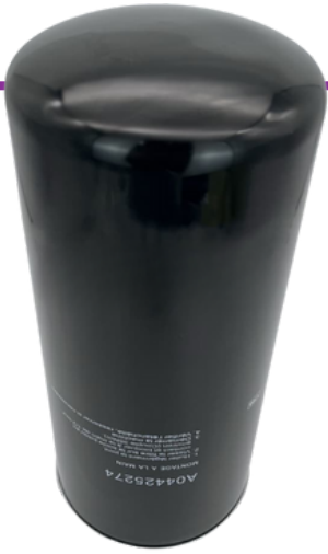
CompAir Oil Filter