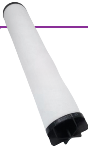
Atlas Copco Line Filter