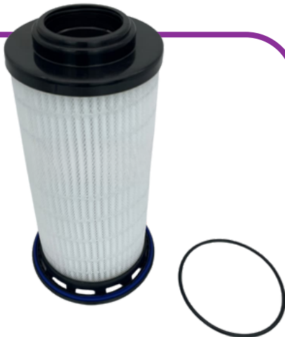
Sullair Oil Filter