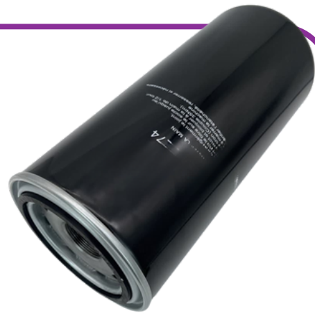
Kaeser/Mann Oil Filter