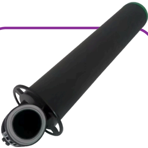
Atlas Copco Line Filter