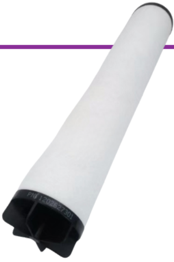
Atlas Copco Line Filter